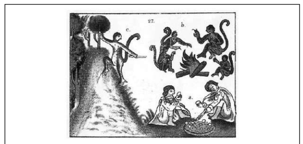
Figure 1. Obtaining monkeys by the Mexican Amerindians.

Finally, Lucas Hombolte (1494–1544) painted a portrait of Catarina de Aragón y Castilla (1509–1533) of Spain with a capuchin monkey (Fig. 2c; Zuckerman, 1998; Fragaszy et al. , 2004). It is neither a tufted capuchin nor a white-faced capuchin, but may be either Cebus albifrons or Cebus olivaceus . Venezuela was the first Spanish territory to be